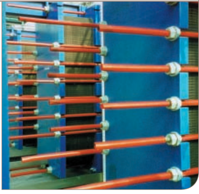
Three Alfa Laval acid coolers used to recover 25 MW of heat from the acid cooling system.

All the old coolers were replaced with three semiwelded Alfa Laval plate heat exchangers in D205 with FPMS gaskets, connected in parallel. The D205 plate material and the FPMS gaskets were selected due to the high acid temperature of 105°C.